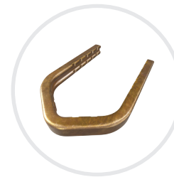
True M/L clip

Provides optimal control during clip loading and closure